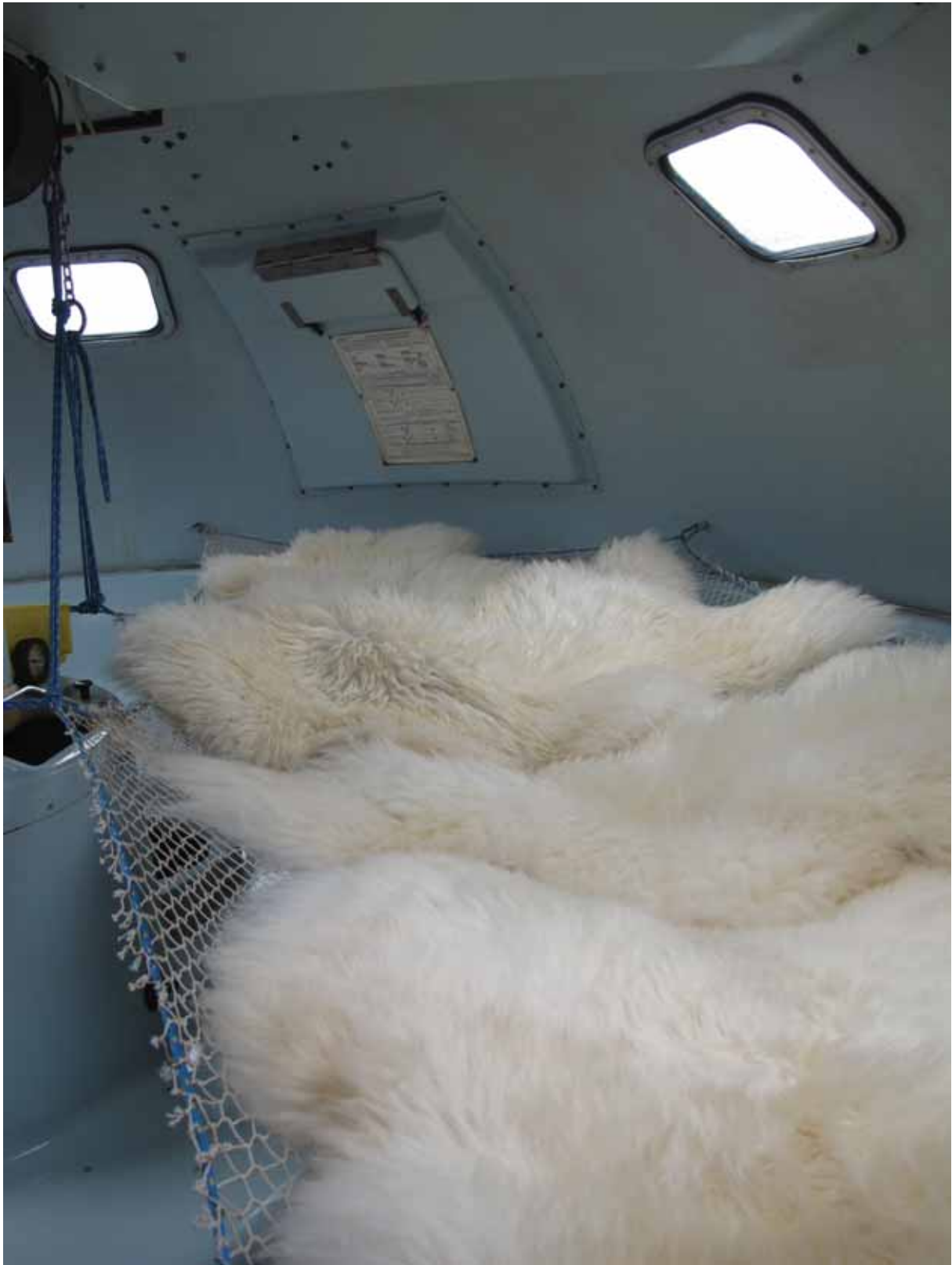
Interior with 'fishnet hammock' and sheepskins