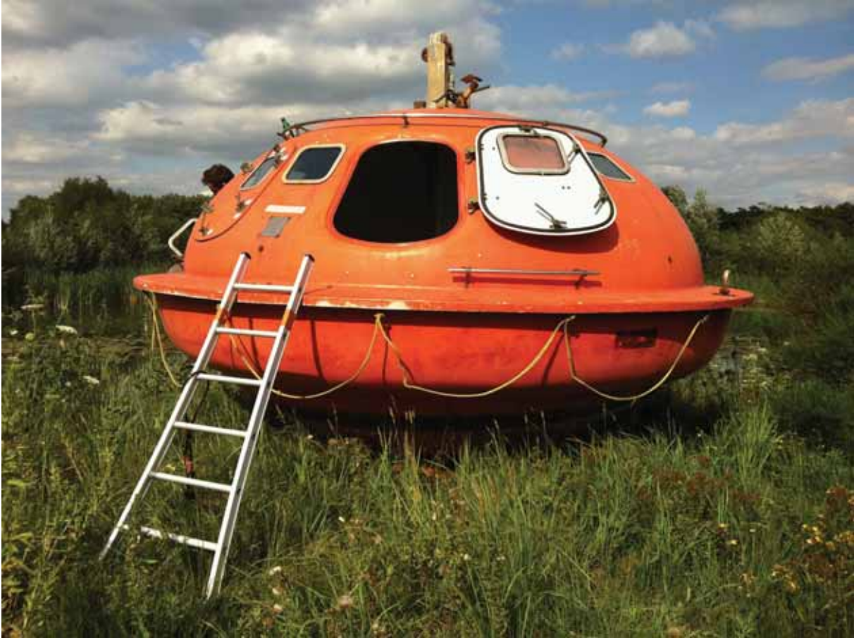
Capsule hotel at the verbeke foundation in Kemzeke, BE