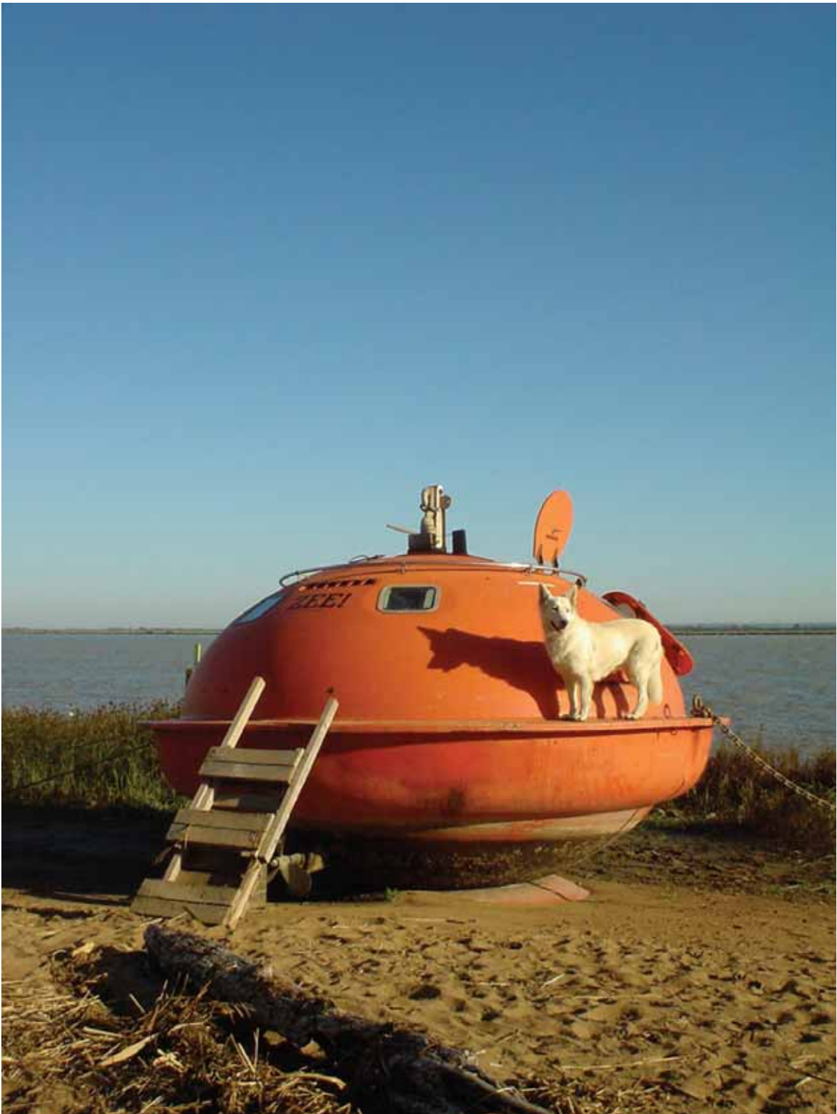
capsule on land in Nantes, Estuaire project