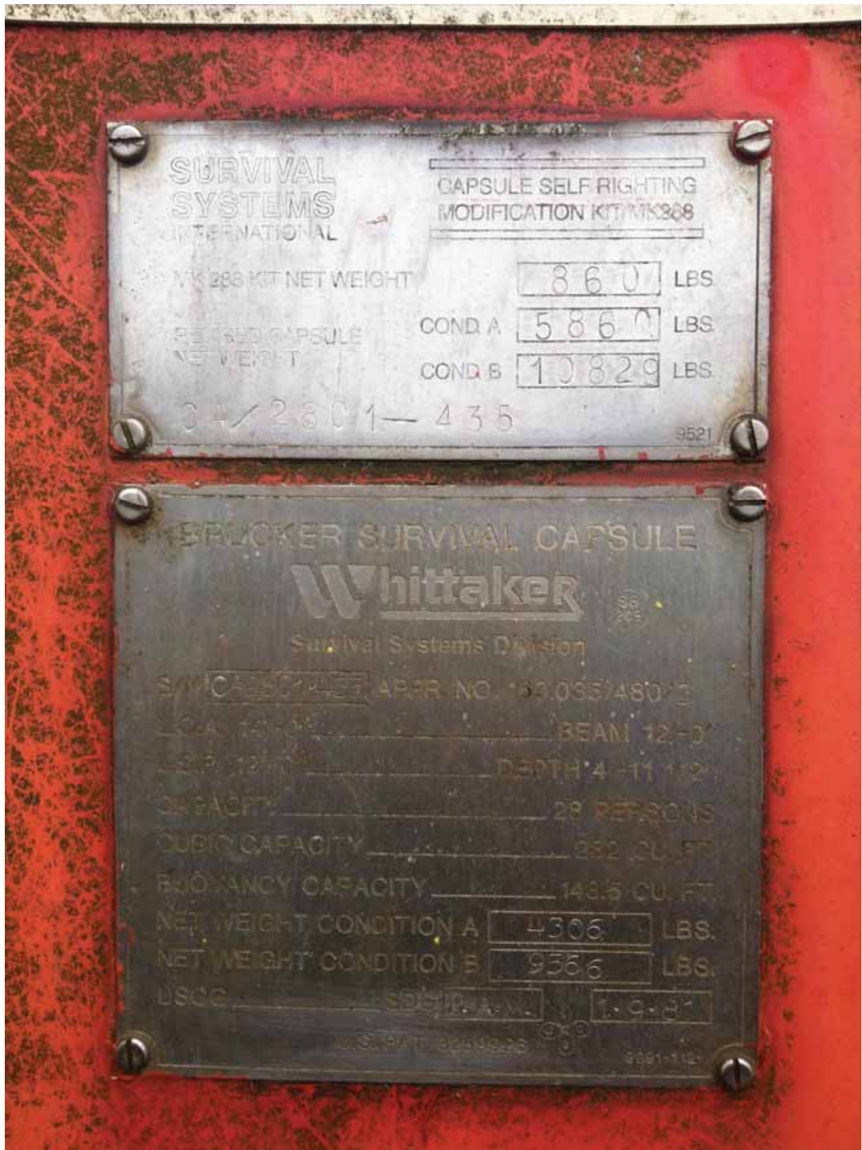
Original data shield on off the capsules