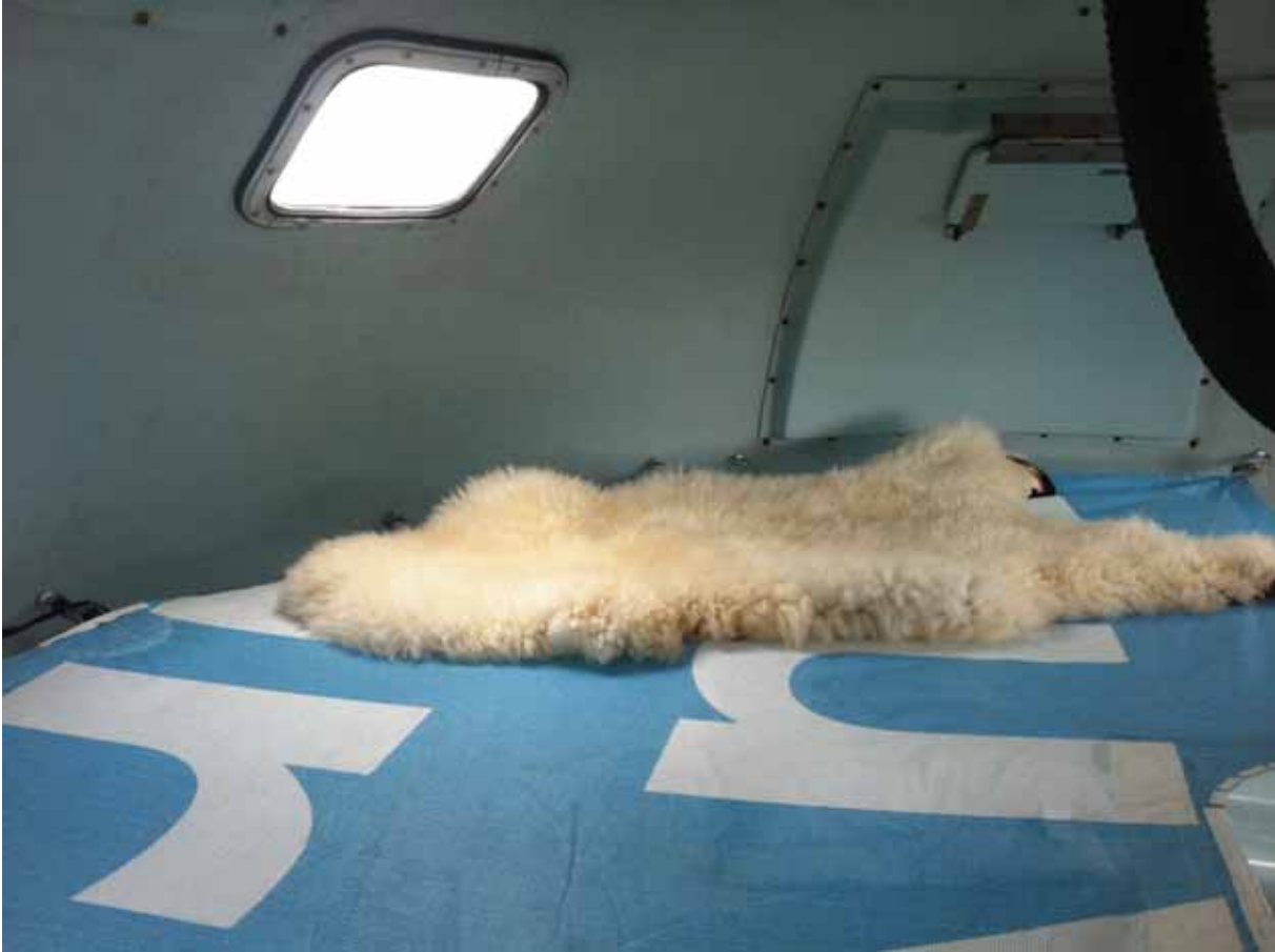
Latest flexible bed from used advertisement textile