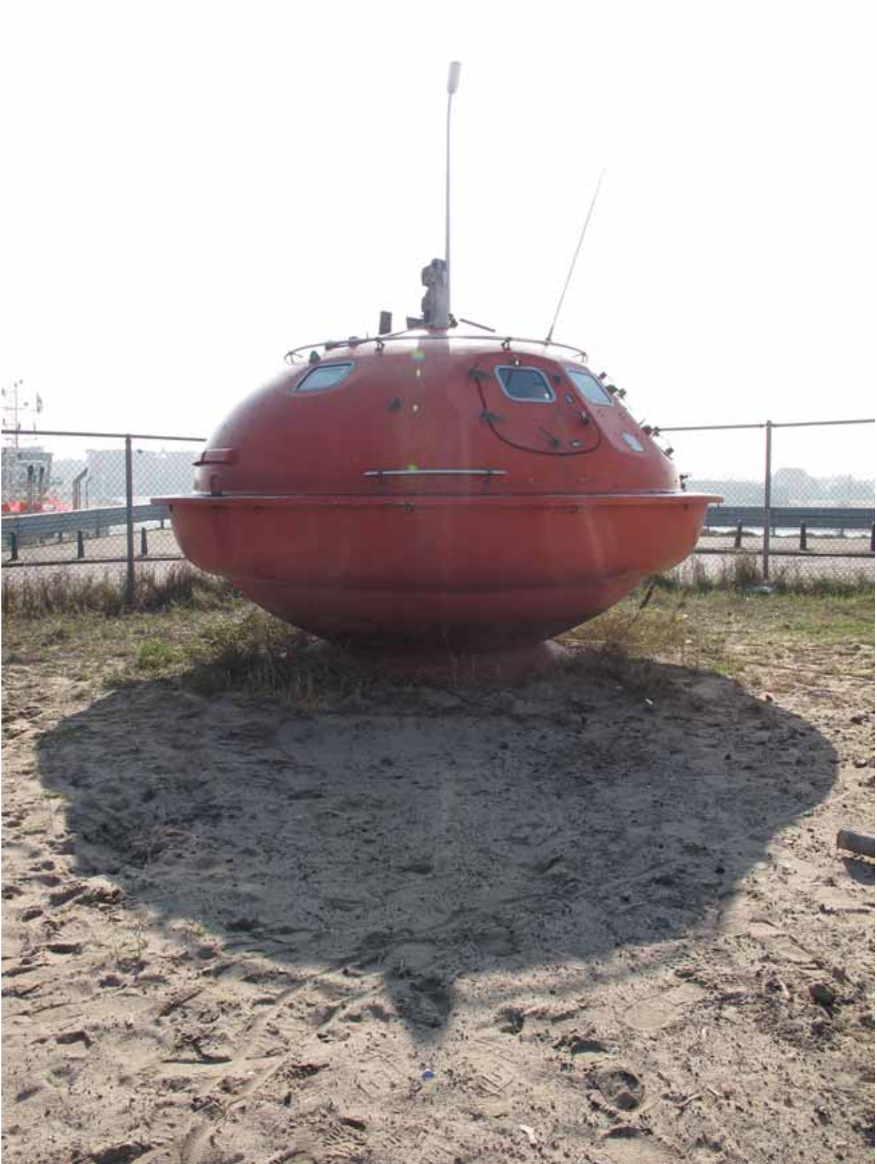
Capsule hotel at f.a.s.t. Surfer's village in Scheveningen, NL