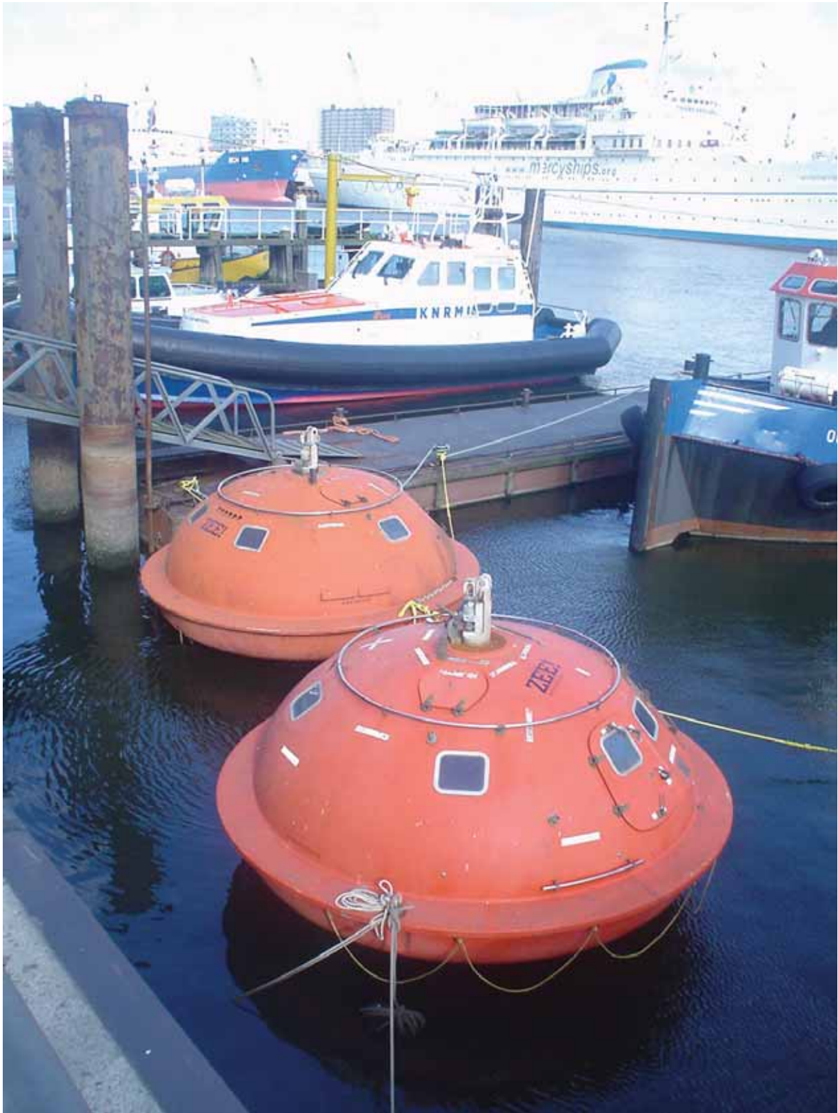
Capsule hotels in Scheveningen, NL